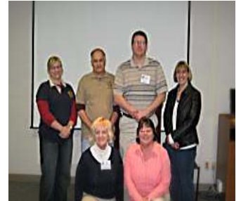
FIRST CIT TRAINING GROUP IN NEW RIVER VALLEY.